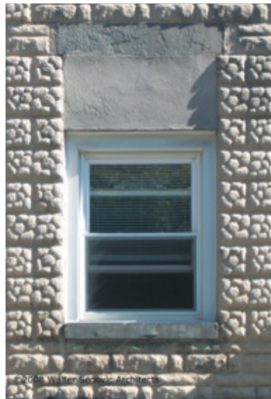
This window replacement resulted in reduced visibility and daylight.

Also missing from the equation is visual transmittance (VT) and light-to-solar gain (LSG). LSG is important as a component of sustainable performance since glass and films used to receive low (i.e., positive) SHGC ratings often reduce the amount of visible light and therefore require a correspondingly increased use of artificial lighting. Clearly, consumers will benefit as more information is provided on labels, and despite efforts, we are not too much further along in understanding the performance of one window over another, and certainly not over the performance of an existing historic window assembly.