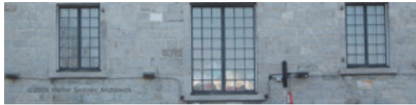
Traditional storm window systems offer not only superior performance and energy efficiency, but can also be a graceful complement to the historic sash.

outfitted with laminated or low-e glass may help to offset the emergence or amount of condensation present, which forms when warmer, moisture-laden air comes into contact with colder glass surfaces. This effect may be mitigated by thoughtful design and selection, and even improved upon over time with alternate choices of weather-stripping systems and glass types.