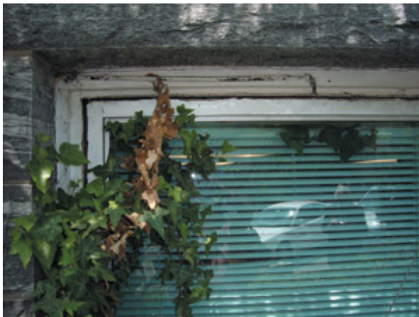
Replacing sash while ignoring the primary sources of infiltration can have detrimental and costly results.

Not true. If you're not already reconsidering replacement based on energy considerations alone, consider these other non-sustainable features of many replacement windows. A poorly performing window that requires replacement after just a few years means additional debris in our landfills, resources extracted for production and energy for manufacturing and transport, none of which is sustainable. Also, the materials that comprise many replacement windows – aluminum, vinyl and glass – are among the greediest in terms of energy consumption, resource depletion and inability to recycle. All leave a heavy environmental footprint.