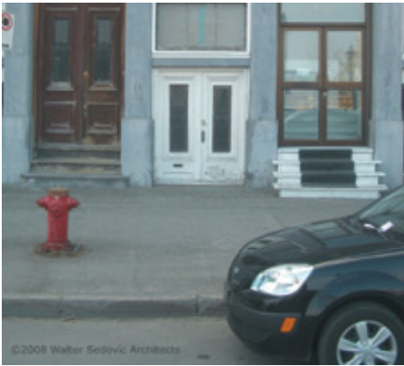
©2008 Walker Sedovic Architects Windows are not the only elements maligned by inappropriate replacements.

sash. Reusing an existing frame that is not tight, within a wall system that leaks will produce the same effects that existed before the replacement window was installed. Any window system – new or old – must be part of a weather-tight system from the sash to the walls.