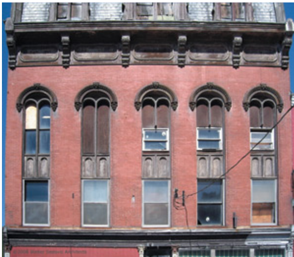
The damage wrought by replacement windows is self-evident and increasingly pervasive.

In just the past few years, both sides in the debate over replacement vs. restoration of historic windows have been called upon to clarify their stance. For those advocates of restoration, there has been a virtual watershed of support, mostly in the form of states, historical commissions and preservation organizations across North America identifying historic wood windows as "endangered" elements.